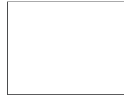
ARTM107 Artmore - Coffee